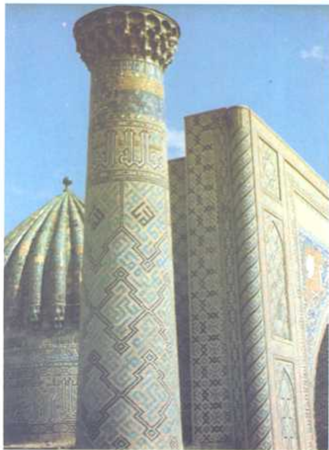
Samarkand, Shir-Dar Madrasah. Detail, 17 th c.